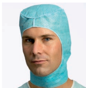
Surgical Hood • 4242