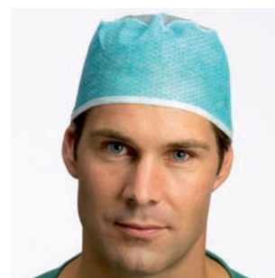
Surgical Cap • 4245