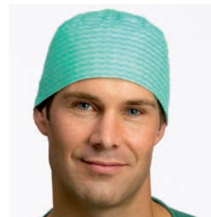
Surgical Cap, Jack • 620300