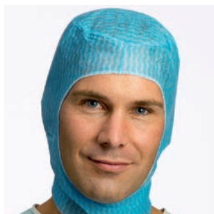
Surgeons Hood, Tuck • 620100, 620105