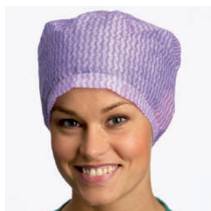
Surgical Cap, Kosack • 621000, 621001, 621005