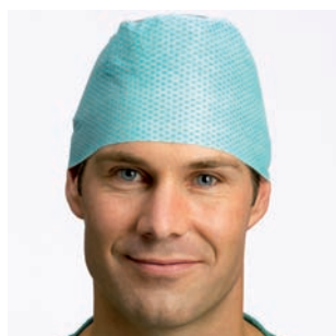
Surgical Cap • 4240