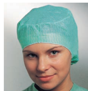
Nurses Cap, Peggy • 621600, 621700