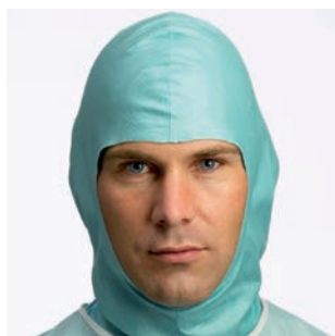
Surgical Hood • 70000002