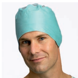
Surgical Cap • 4241