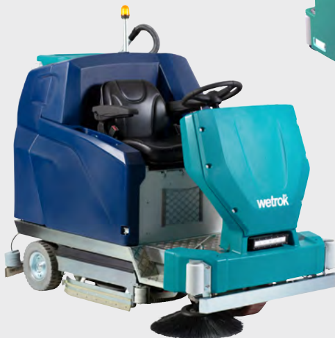
Drivematic Deluxe Luxury version for large areas