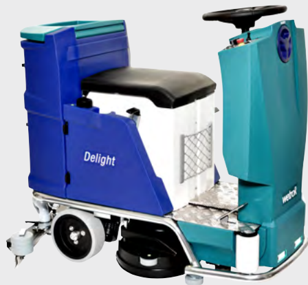
Drivematic Delight Expert in tight areas

More comfort, security and maximum efficiency: the three Drivematic ride-on scrubber-driers from Wetrok offer all that and much more. Whether in narrow supermarket aisles, extensive corridors or large warehouses, the models from the Drivematic series ensure perfectly clean floors. Select the model of your choice now.