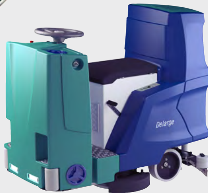
Drivematic Delarge Specialist in larger spaces